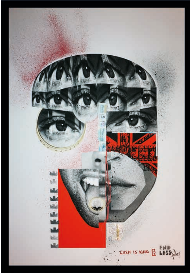
Cash Is King Portrait 1, 2025 Digital, hand painted acrylic and spray paint on 300gsm fine art paper with collaged money. 70 x 50 cm. inframed - 27.56 x 19.69 in. inframed