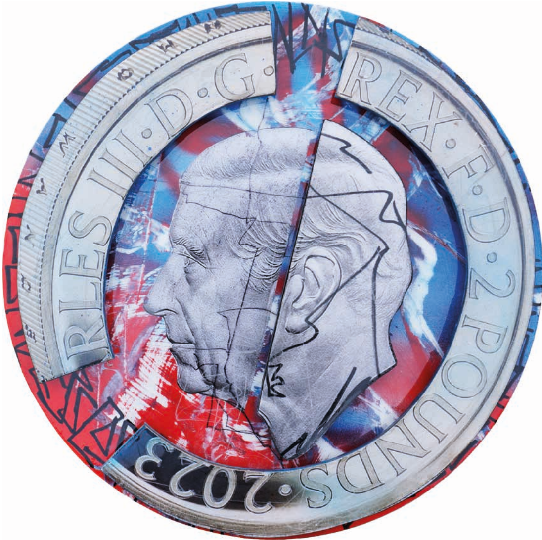
Oil and acrylic based paints with digital collage on wood and canvas with a resin finish. Signed on the back of the canvas. 60 cm diameter - 23.62 in diameter