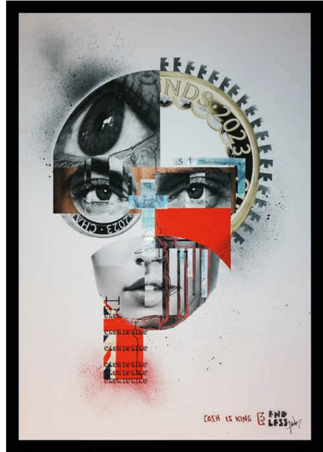
Cash Is King Portrait 2, 2025 Digital, hand painted acrylic and spray paint on 300gsm fine art paper with collaged money. 70 x 50 cm. inframed - 27.56 x 19.69 in. inframed